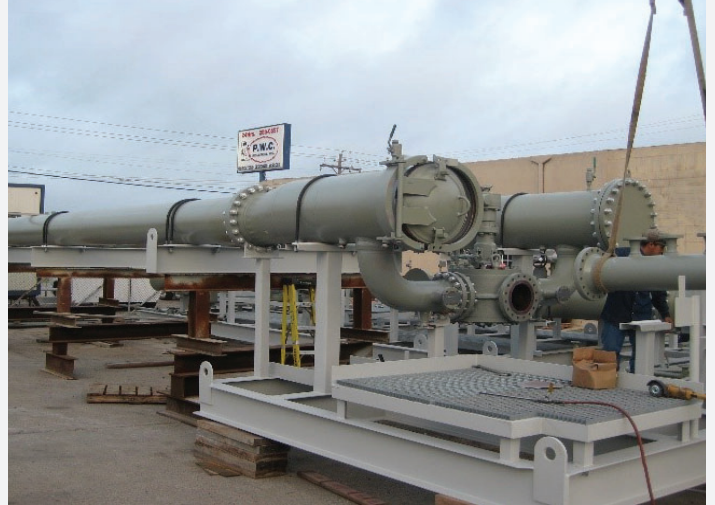
Commissioning of prover system on site