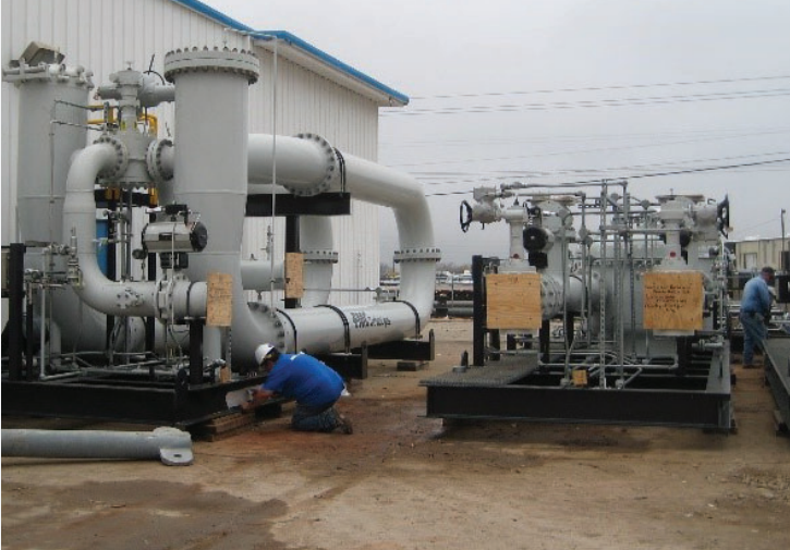
Prover system during final assembly

Brodie International has decades of experience in handling provers. The Brodie prover engineers are experienced in designing, engineering, manufacturing and testing all types of provers.